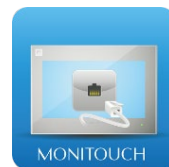
Icon image of “Simple Remote”