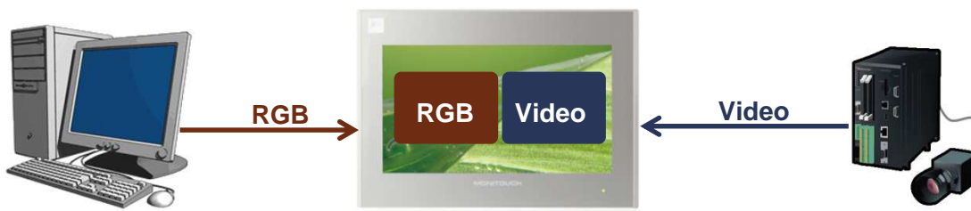
A schematic view for the simultaneous display for video and RGB

V9 series can be used as a monitor of the image processing apparatus by attaching units for RGB input or video input. Also, V9 series can monitor the image processing apparatus and display the screen from PCs at the same time by using multi-channel units such as GUR-10, the unit for video input + RGB input.